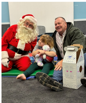
ANNUAL BUILD-A-BEAR DELIVERY AT WINDFALL