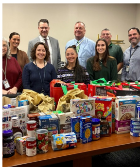
JUVENILE PROBATE STAFF