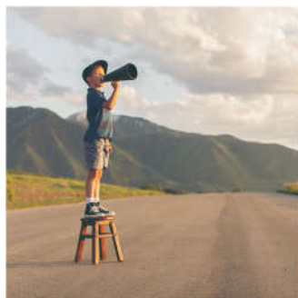
Court-Appointed Special Advocate (CASA) Program Prepares to Launch in Medina County